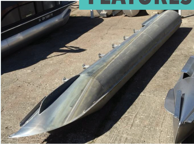
New/Reject/Used OEM 3rdTube 20'x25"